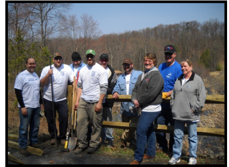
Volunteers from PPL built a fence around the lake at the Hawk Mountain Boy Scout Camp.