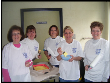
Volunteers from Tobash Insurance painted the kitchen at Avenues.

With over 115 people volunteering on April 15 & 16, we were able to complete over 15 projects, helping 10 of our agencies to improve their facilities. Check out the pictures below of some of the volunteers who helped their community!