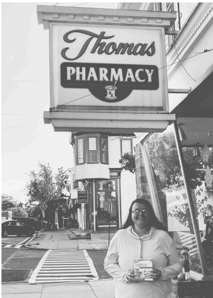
Thomas Pharmacy partners with SUW to purchase bulk items at cost for Nurse's Pantry.