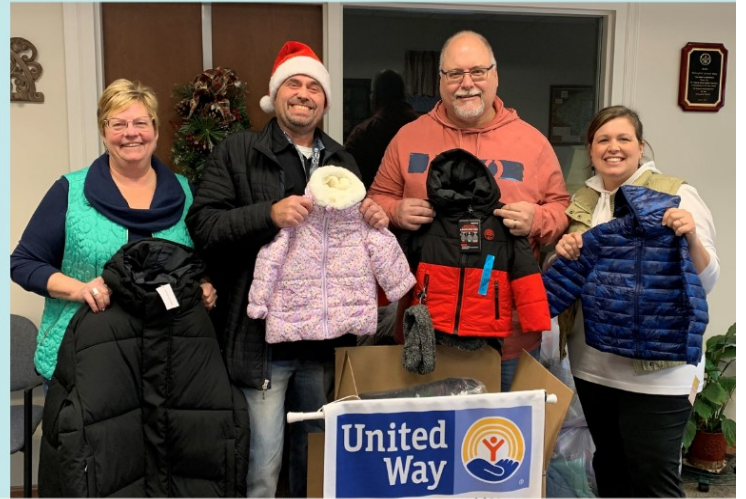
Employees from Amazon - Bethel donated & delivered 60 new winter coats for our Partner Agencies!