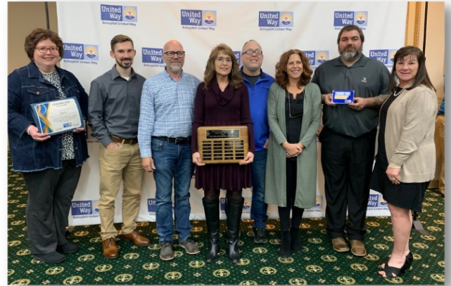
Hydro employees attending the SUW Appreciation Breakfast.

They took top honor with $177,262 in contributions! Thank you for your continued commitment to Schuylkill County.