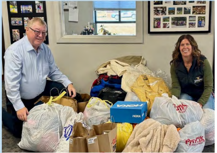
Employees from Yuengling donated & delivered new & gently used winter items for our Partner Agencies!