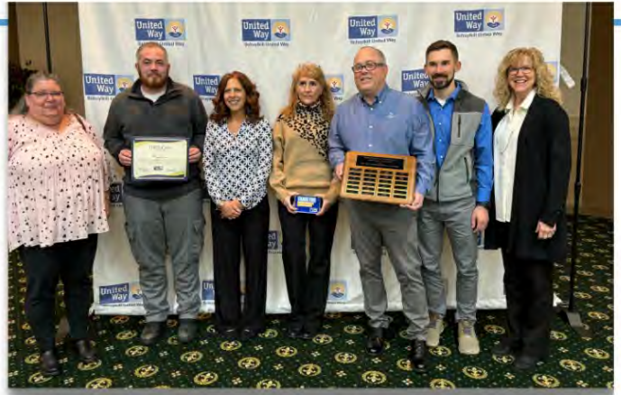
Hydro employees attending the SUW Appreciation Breakfast.

They took top honor with $181,030 in contributions! Thank you for your continued commitment to Schuylkill County.